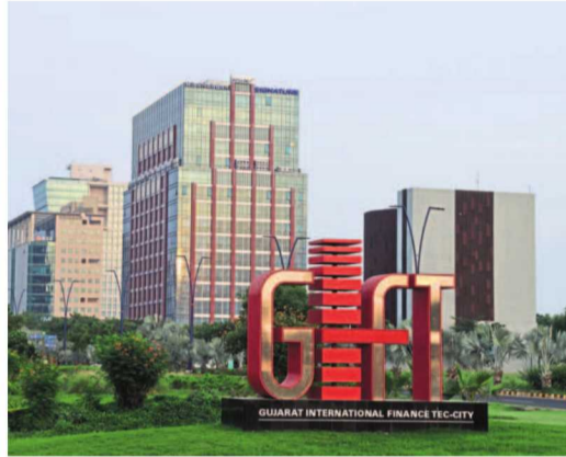
Fintech startups are using the GIFT City route to build one-stop platforms that would combine payments, investing and broking services for NRIs.

For both companies, their licences are the moat. Belong has a payment service provider (PSP) licence apart from its distributor and broking licences, while Vested has applied for a PSP licence, which would allow it to move money, manage payments, and build a multi-currency wallet inside the app instead of relying on a partner bank.