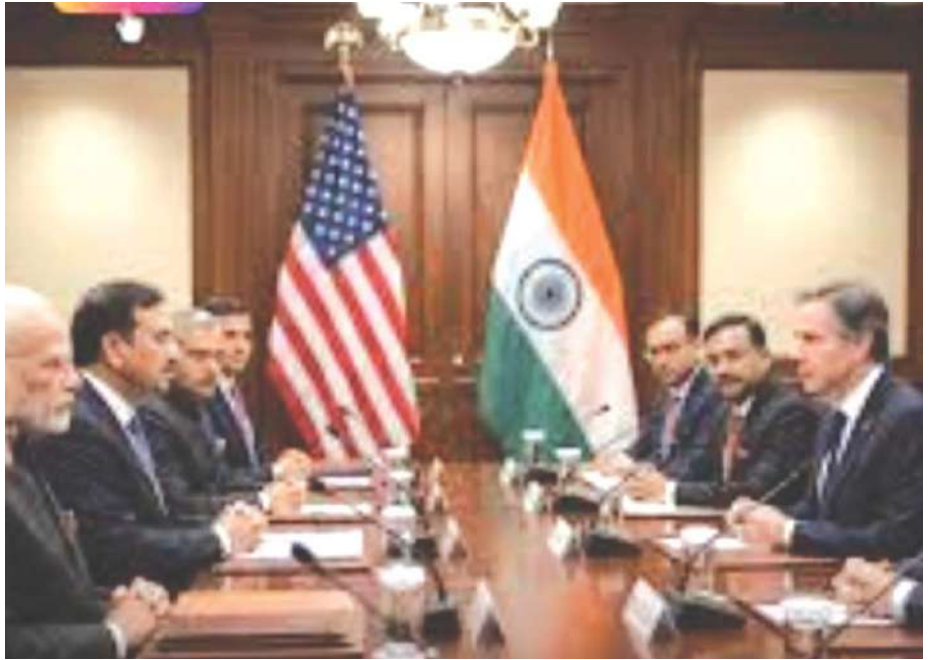
স্বাভাবিক বিষয়। সেই সম্পর্কে কোনও নির্দিষ্ট জোট পরিবর্তনের ইঙ্গিত হিসেবে দেখা উচিত নয়। রুবিও আরও বলেন, ভারতের পাকিস্তান-সংক্রান্ত উদ্বেগ সম্পূর্ণ ভিন্ন ধরনের। ভারত বরাবরই পাকিস্তানের মাটি থেকে সক্রিয় জঙ্গি সংগঠনগুলির কার্যকলাপ এবং সীমান্তপারের সন্ত্রাসবাদ নিয়ে উদ্বেগ প্রকাশ করেছে। এই ইস্যুই দুই দেশের দ্বিপাক্ষিক সম্পর্কের ক্ষেত্রে প্রধান বাধা হিসেবে রয়ে গেছে। তবে পাকিস্তানের বর্তমান কূটনৈতিক তৎপরতা বা ইরান

ধরেন তিনি। গত কয়েক বছরে ভারত-আমেরিকা সম্পর্ক উল্লেখযোগ্যভাবে মজবুত হয়েছে। প্রতিরক্ষা চুক্তি, যৌথ সামরিক মহড়া, প্রযুক্তিগত সহযোগিতা এবং ইন্দো-প্যাসিফিক অঞ্চলে চীনের ক্রমবর্ধমান প্রভাব মোকাবিলায় দুই দেশের মধ্যে ঘনিষ্ঠতা বেড়েছে। কোয়াড বৈঠকও এই বৃহত্তর কৌশলগত সমীকরণের অংশ হিসেবে দেখা হচ্ছে। রুবিও বলেন, ভারত-আমেরিকা সম্পর্ক আগামী দিনে আরও শক্তিশালী হবে। দুই