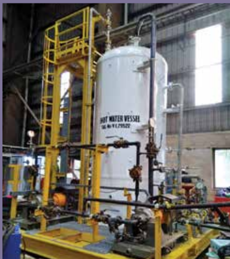
Hot Water Package