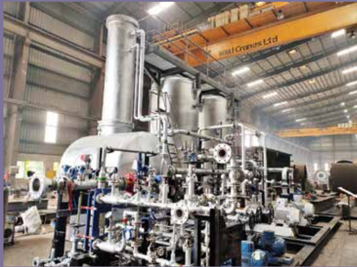
Vapour Recovery Unit (Petrochemical Refinery)