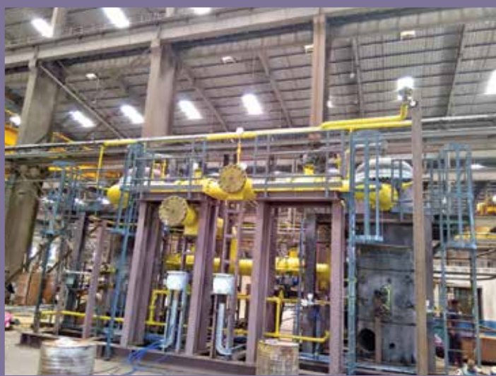
Fugitive Gas Conditioning system